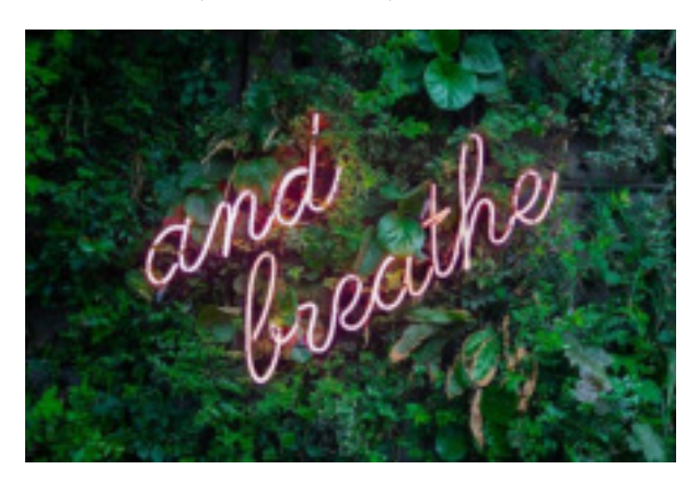
Reflexology 120 Euros per person

A simple but profound Japanese technique for stress reduction and relaxation that also promotes healing. It is administered by "laying on hands" and is based on the idea that an unseen "life force energy" flows through us and is what causes us to be alive. If one's "life force energy" is low, then we are more likely to get sick or feel stress, and if it is high, we are more capable of being happy and healthy.